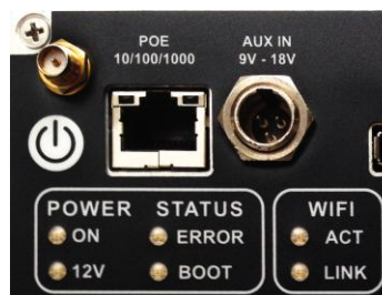
PoE or DC inputs

Optional On-Board Battery: With the optional rechargeable NiMH battery pack installed, the software reports battery levels, and seamlessly switches to battery operation in the event of a loss of power.