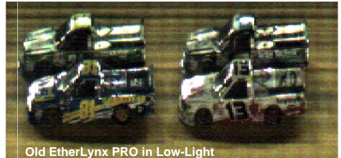
Old EtherLynx PRO in Low-Light