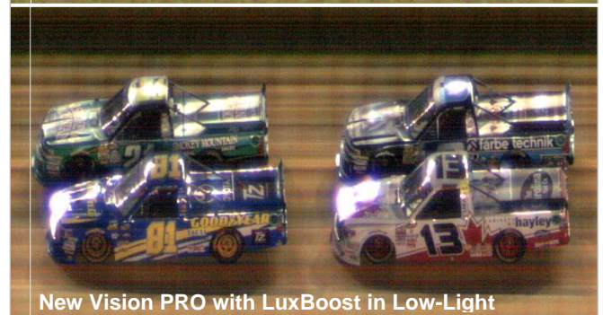
New Vision PRO with LuxBoost in Low-Light